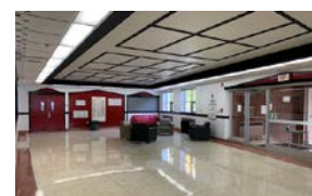
Dr. Brass School