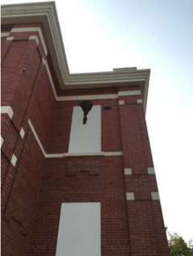
This is a picture of the bees swarming at the top of the 1919 section of the school.