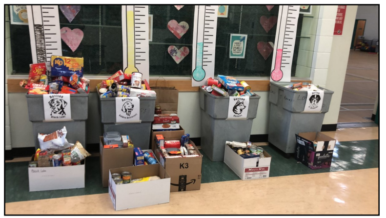
Photo above: Students at Davison School also collected non-perishable food items in the month of December which were then donated to the Melville Food Bank.