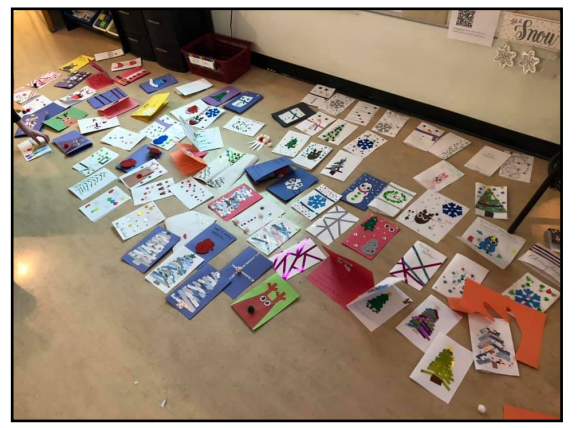
Photo above: Elves from Davison School made encouraging holiday cards to deliver around the City of Melville.

Photo to the left: Norquay School elementary students participated in the Sleigh Bells for Seniors this year, making over 100 cards to be delivered to nursing homes.