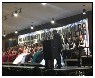
Photos\ above\ from\ L\ to\ R : Canora Composite graduation, Norquay Grade 12 graduates, Invermay Grade 12 graduates and Esterhazy High School graduation.