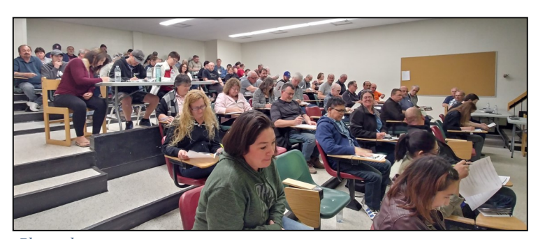
Photo above: The caretakers in GSSD take part in WHMIS 2015 training.