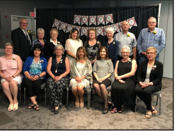
Photos\ above\ from\ L\ to\ R:\ Preceville\ School\ Kindergarten\ graduation,\ Columbia\ School\ Grade\ 8\ graduation,\ Sturgis\ Composite\ Grade\ 12\ graduation\ and\ the\ 2019\ GSSD\ Retirees.