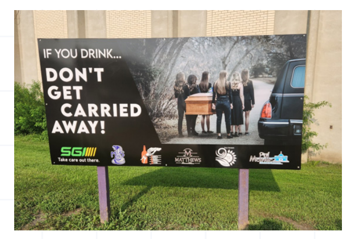
Pictured above: The new permanent billboard at MCS school.

Pictured to the left: The temporary 10' X 40' billboard located along Highway 10 near Duff, SK.